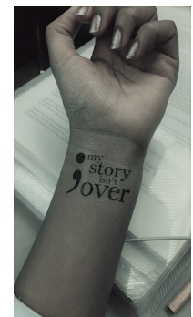
Right: Kyla Cummings Berkley High School Photography Second Place Winner

Interested in registering or scheduling "Tech Talk" Training at YOUR school contact SLS at 248-706-0757 or dmf@SLStoday.org